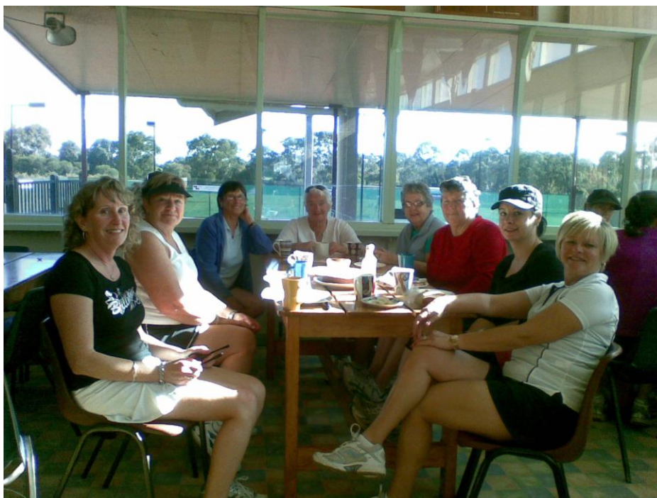
Sale Magpies enjoying their morning tea with the Maffra Smylies